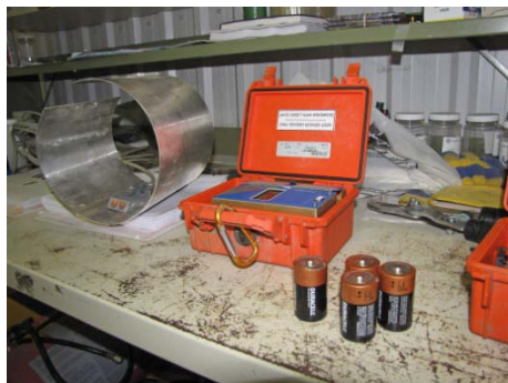
Stingray Level-Velocity Loggers Prepared for Deployment in the Sewage Collection System

An average of one cubic meter a day per household was used as a guide for the amount of water used in a 24 hour time interval. Locations monitored by Stingray Level Velocity Loggers recorded flow rates 15-70% higher than statistical flows. The loggers captured spikes in flow that matched typical run times from domestic sump pumps. Because the Stingray is able to monitor water temperature, Shawn also observed corresponding temperature drops matching the pump cycles. The evidence was clear: residents were connecting sump pumps to the municipal collection system.