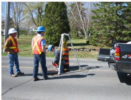
Manhole Location Selected for Flow Survey