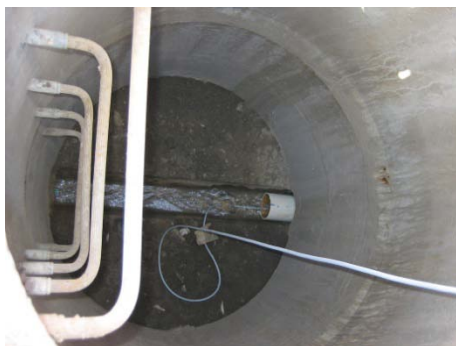
Level-Velocity Sensor Installation in Manhole Inlet Pipe

The I&I study of the Glen Walter Sewage Collection was conducted from May 16th to June 9th 2006. The instrument's ultrasonic sensors were installed in 7 different manholes for periods of 3 to 5 days. To capture detailed flow information the Township set the Stingrays to take readings at 10 second intervals. To deploy each unit, a township technician selected a manhole location, attached a stainless steel bracket in the influent pipe, then mounted the sealed, ultrasonic sensor into it. The technician connected the sensor cable to the watertight electronic logging unit and hung it inside the manhole. The logger recorded the date and time, water level, velocity and temperature.